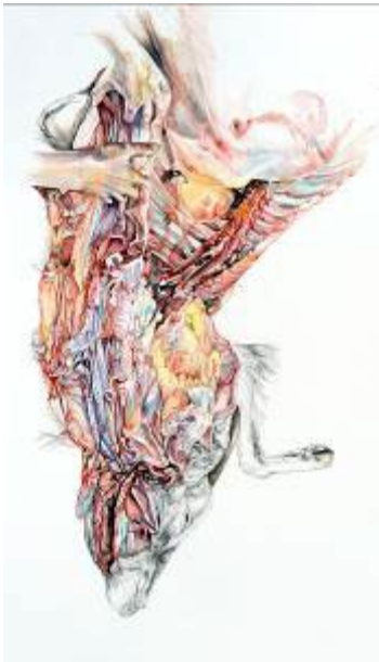
Philippa Jones, Study For: Exposed and Explored , the exquisite insides maintain their shroud: no answers to life found, 51 x 29.5, Watercolour and ink on Fabriano Paper, 2019 (St. John's)