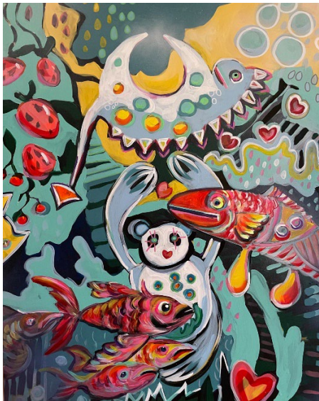
Anastasia Tiller, Land and Sea Fiesta , 22 x 28, Acrylic on birch panel, 2021 (Lethbridge)