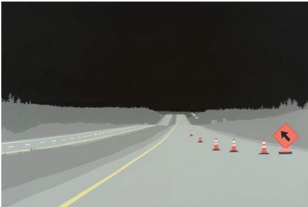
Kym Greeley, I've Got My Bags Packed , 32 x 48, Acrylic on canvas over cradled panel, 2017 (St. John's)