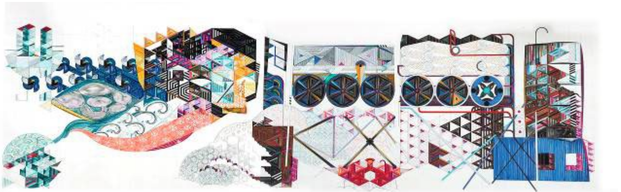
Vessela Brakalova, Synergy (360 degrees of Port Union/Life in Patterns) , 36 x 120, Watercolour markers on cotton paper, n/d (Portugal Cove - St. Philips)