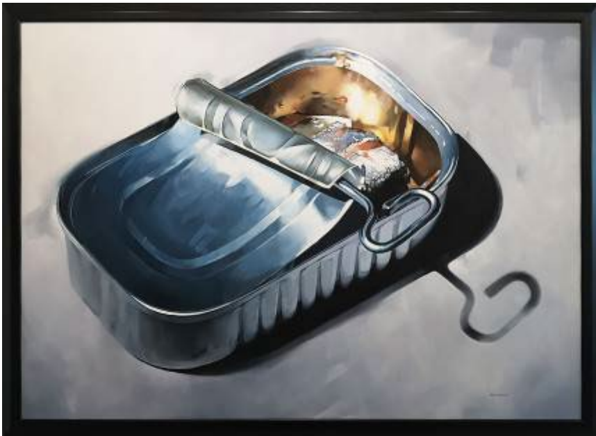
Grant Boland, Canned Fish , 48 x 66, Oil on canvas, 2015 (St. John's)