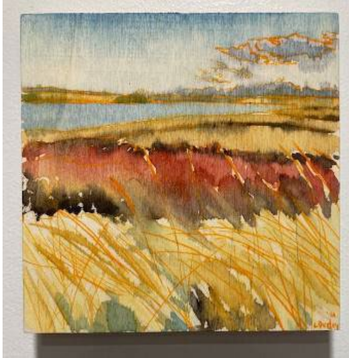
Lori Deeley, Pond Edge , 5 x 15, Acrylic ink and watercolour paint on cradle board, 2021 (Kippens)