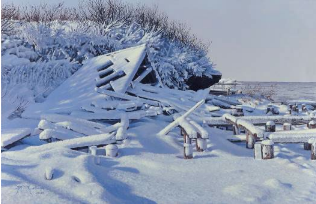
Brian LaSaga, Winter Silence , 13 X 20, Acrylic on panel, 2021 (St. George's)