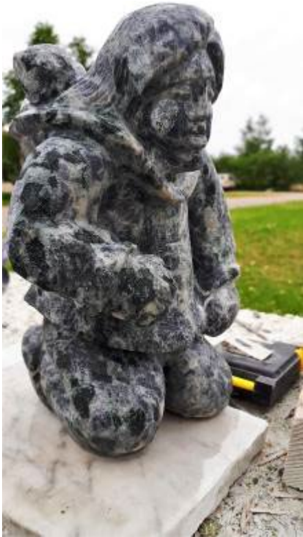
Dale Ford, Mother and Child , 8 x 5 x 4, Labradorite, 2021 (Happy Valley-Goose Bay)