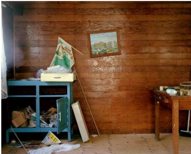
Ethan Murphy, Our Place ed.2/5 , 32 x 40, Photograph, 2018 (St. John's)