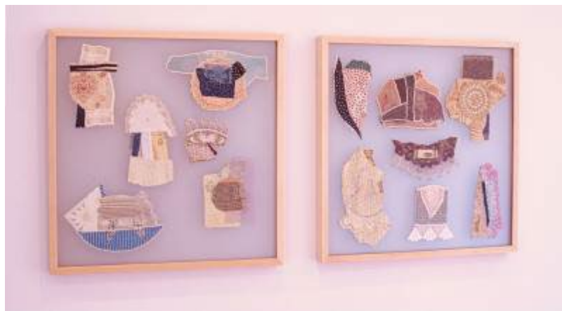
Shawn O'Hagan, House Birds , 24 x 48, Mixed media, 2021 (Corner Brook)