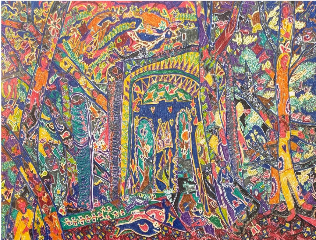
Toby Rabinowitz, The Secret Castle , Ink on paper, 2022.