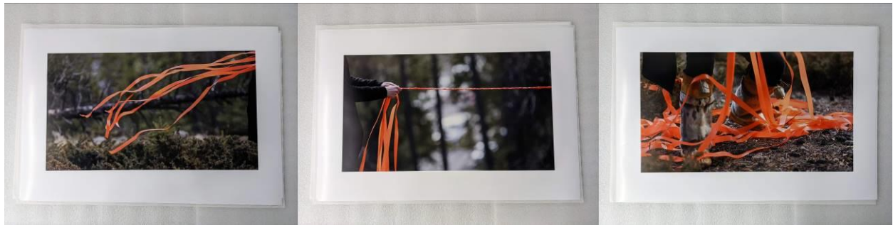
Meagan Musseau, when they poison the bogs we will still braid sweetgrass , Photographs printed on Epson photopaper, 2022.