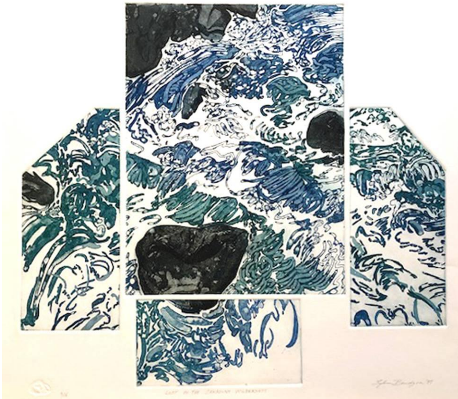
Sylvia Bendzsa, Lost in the Canadian Wilderness 1/15, 4 Plate etching, 1997.