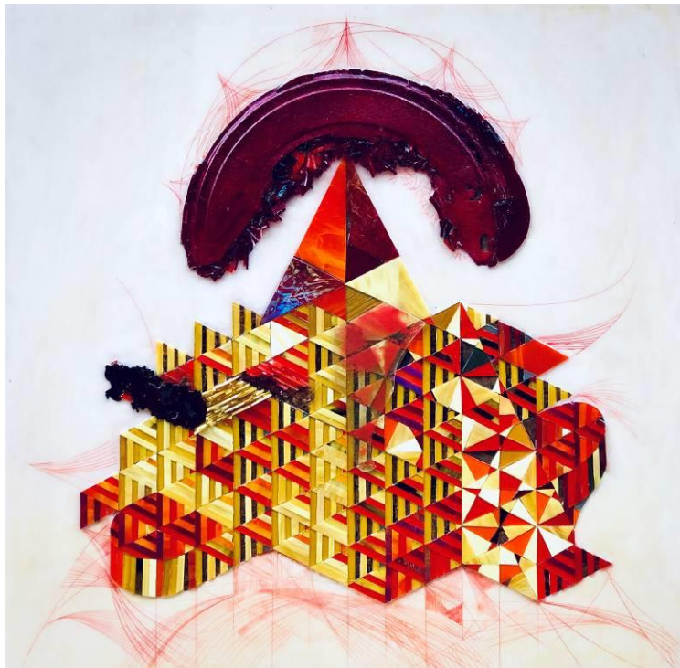
Vessela Brakalova, Break or Brake #2 , Mixed media, 2021.