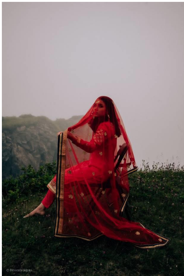
Devanshi Jagota, A Veil of Fog , Photography print on Luxe fine art matte paper, 2020.