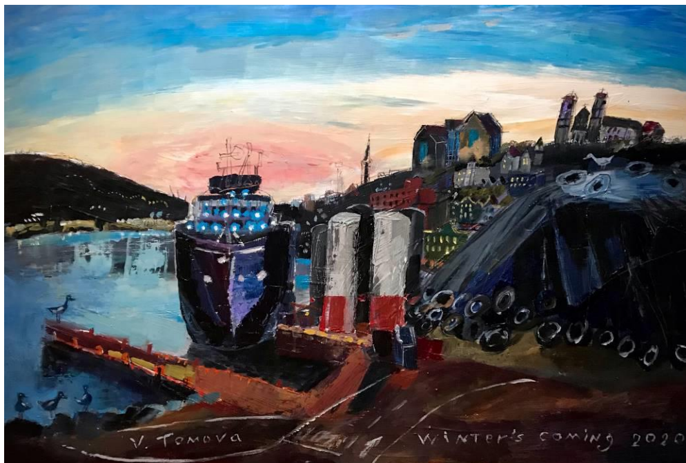
Veselina Tomova, Winter's Coming , Acrylic on canvas, 2020.