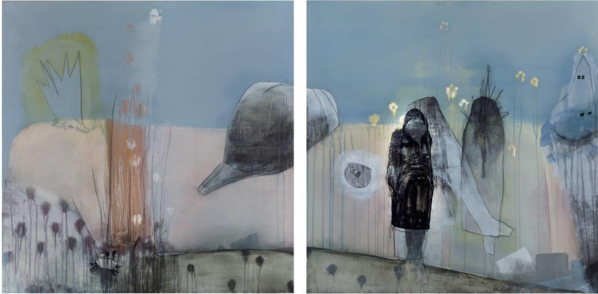
Michael Pittman, Camp , Acrylic, India ink, graphite, charcoal on birch panel, 2021.