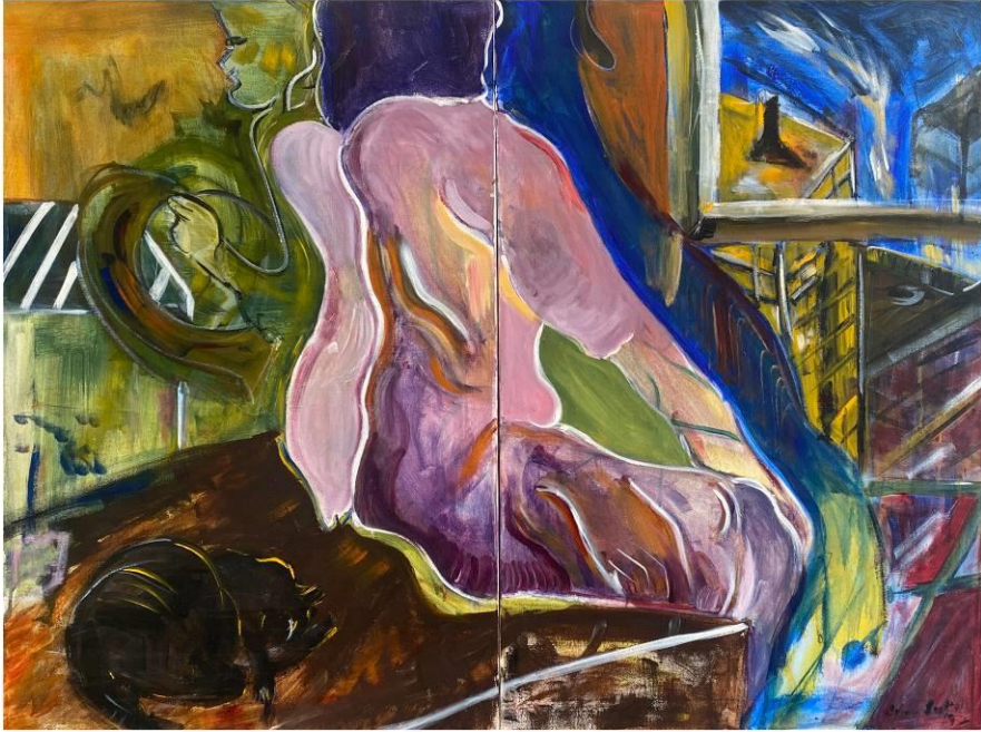
Bonnie Leyton, The Visitor , Acrylic on canvas (diptych), 2019.