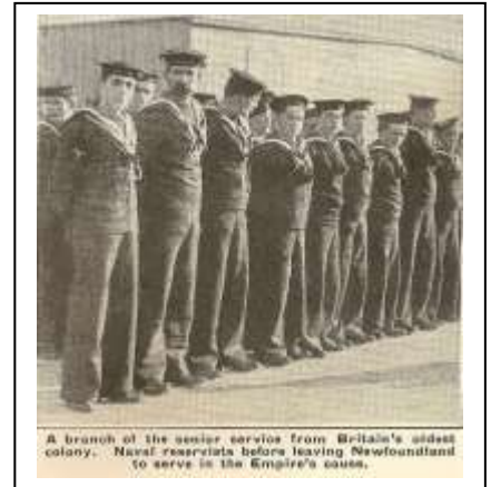
A branch of the senior service from Britain's oldest colony. Naval reservists before leaving Newfoundland to serve in the Empire's cause.

Of course, the purpose of having a reserve force at any time is to provide a trained force ready at any time to serve at a time of need or crisis. Thus in August of 1914, upon the Declaration of War by the government in London, hundreds of those men of the Royal Naval Reserve (Newfoundland) were to make their way to St. John's, from there to take passage overseas to bolster the ranks of the Royal Navy.