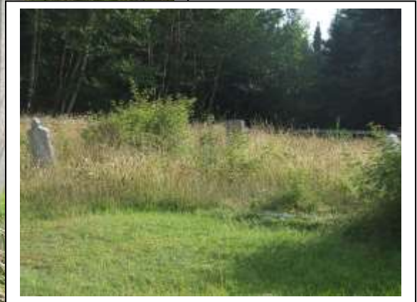
Seaman Edward Tilley, Number 2399x, is interred in Harcourt Cemetery in the community of the same name, Trinity Bay.