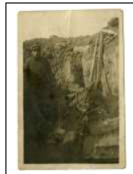
(Right below: An un-identified Newfoundland soldier in the trenches at Suvla Bay –)

By this time the situation there had daily been becoming more and more untenable, thus on the night of December 19-20, the British had abandoned the entire area of Suvla Bay – the Newfoundlanders, the only non-British unit to serve there, to form a part of the rear-guard.