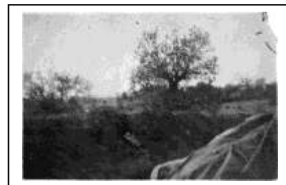
(Right: No-Man's-Land at Suvla Bay as seen from the Newfoundland positions )

There were to be many casualties on both sides, some of them, surprised by the sudden inundation of their positions, fatalities who had drowned in their trenches – although no Newfoundlanders were to be among that number. Numerous, however, had been those afflicted by trench-foot and by frost-bite.