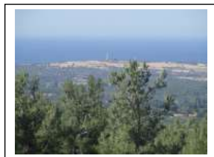
(Right: Cape Helles as seen from the Turkish positions on the misnamed Achi Baba, positions which were never breached: The Newfoundland positions were to the right-hand side of the picture. – photograph from 2011 )

The British, Indian and Anzac forces – the Australian and New Zealand Army Corps was also to serve at Gallipoli – had by now simply been marking time until a complete withdrawal of the Peninsula could be undertaken.