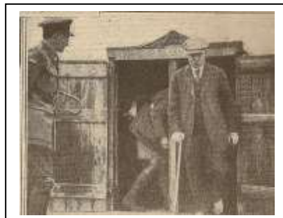
(Right above: The Prime Minister of Newfoundland visiting the 1 st Battalion of the Newfoundland Regiment, encamped at Meaulté )

They had even had the pleasure of a visit from the Regimental Band come from Ayr, and also one from the Prime Minister of Newfoundland, Sir Edward Morris, the latter on March 17, St. Patrick's Day.