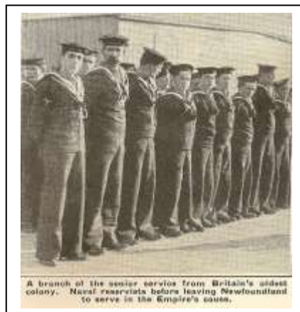
A branch of the senior service from Britain's oldest colony. Naval reservists before leaving Newfoundland to serve in the Empire's cause.

(Preceding page: H.M.S. 'Calypso' in full sail. She was to be re-named 'Briton' in 1916 when a new 'Calypso', a modern cruiser, was launched by the Royal Navy.)