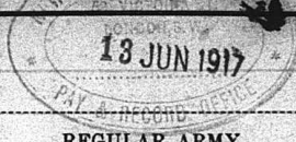
Table 1.—GENERAL TABLE.