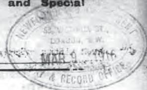
TABLE I.—GENERAL TABLE.

Birthplace ... Parish _____ County _____